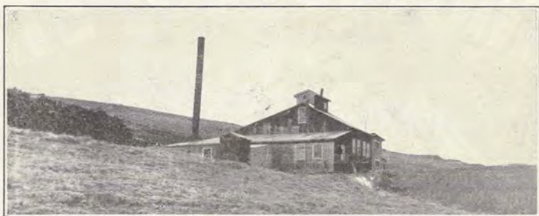
SHAFT HOUSE ON THE 1914 GROUP NEAR ATLANTIC OPERATED BY THE GOLDEN GATE MINE AND TIMBER COMPANY

Near the Bryan is the Garfield Mine, having a shaft and levels run on some rich ore lenses and some further work on the low-grade ores noted in the usual connection with the rich lenses.