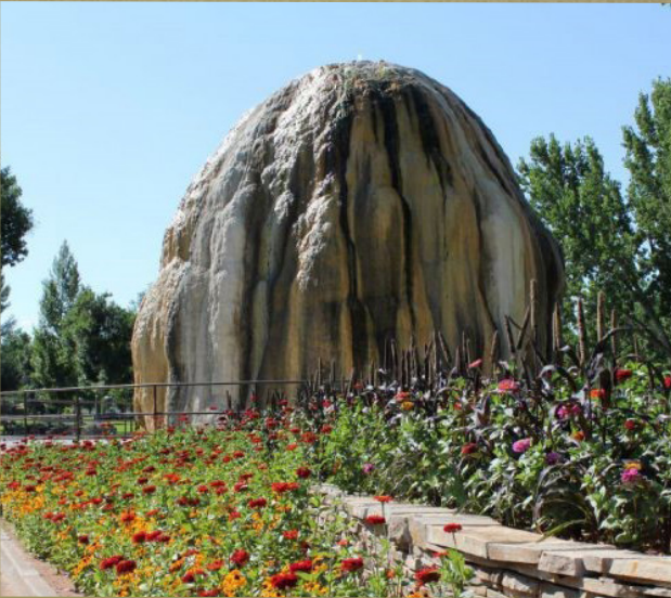
Photo at right: Tepee Fountain, a fabricated travertine feature, was formed by piping heated groundwater to the surface.

Big Spring and White Sulphur Spring are the only two active springs in the park currently. In the last 40 years, Bathtub, Black Sulphur, Railroad, Terrace, and Piling springs have stopped flowing. Tepee Fountain, a man-made feature in the park, is fed by thermal water redirected from Big Spring. The fountain, originally built in 1906, is cored by a stone pyramid surrounding a steel pipe. As water flowed over the stone, travertine coated the feature and turned it into what is seen today.