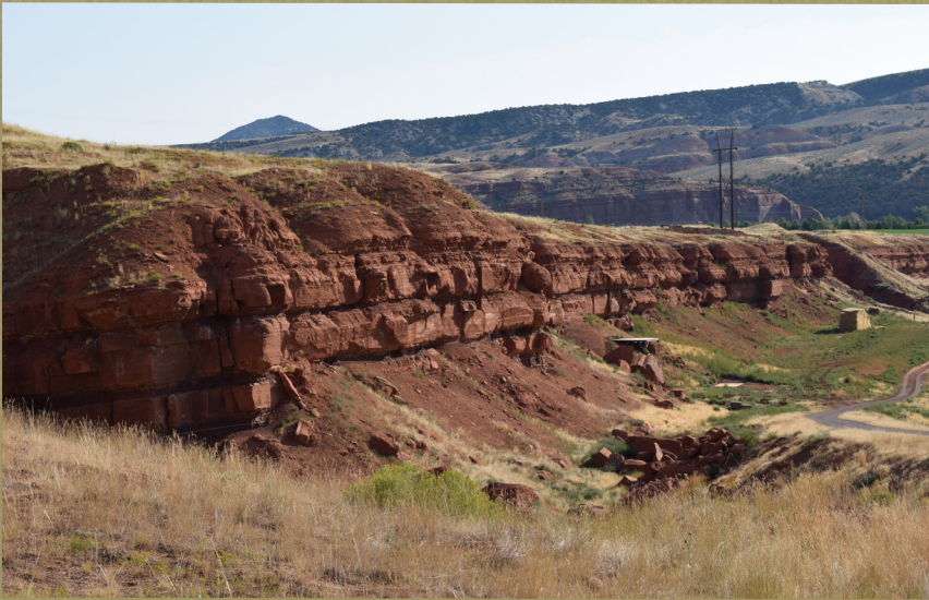
Triassic "red beds" like those seen throughout the park.

The geologic event that led to the eventual formation of the park’s physical features occurred between 70 million and 35 million years ago. This significant mountain-building episode, known as the Laramide orogeny, exerted compressional forces forming large faults and arch-shaped folds called anticlines. Steeply tilted, younger, sedimentary rocks are exposed on the flanks of these anticlines; older Precambrian rocks commonly make up the center of the anticlines. The nearby Owl Creek Mountains are an example of such anticlines. The smaller Thermopolis Anticline runs through the park and town, exposing Triassic “red bed” rock layers throughout the park, particularly on the east side.